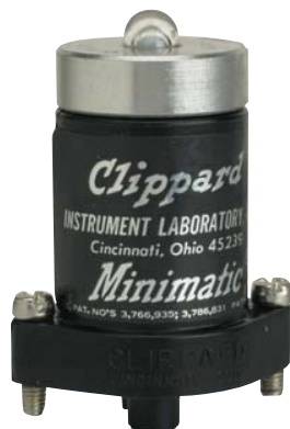
Twin Pilot 4-Way Valve