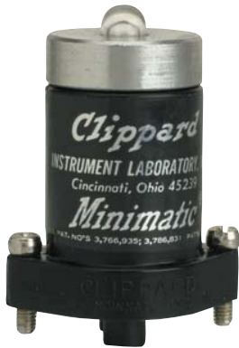
Twin Pilot 4-Way Valve