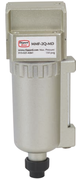
MMF-2Q-MD Filter with metal bowl & automatic drain

Maximatic filters remove moisture and contaminants, and provide air filtration through a 25 micron filter. Replacement 25 micron and 5 micron filters are available.