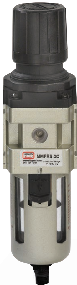
MMFRS-3Q Stacking filter-regulator with bowl shield & semi-automatic drain