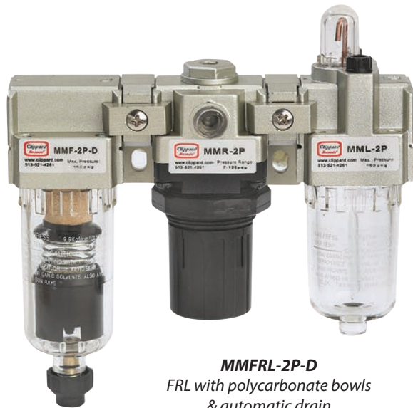
MMFRL-2P-D FRL with polycarbonate bowls & automatic drain