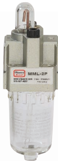
MML-2P Lubricator with polycarb. bowl