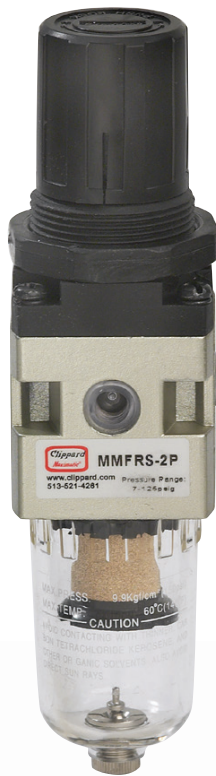
MMFRS-2P Stacking filter-regulator with polycarbonate bowl & manual drain

Stacking filter-regulator combinations provide air filtration and precise regulation in a single unit for easy mounting and installation where space is limited. Includes bracket and gauge.