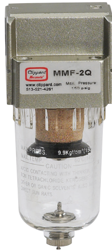
MMF-2Q Filter with polycarbonate bowl & manual drain