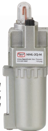
MML-2Q-M Lubricator with metal bowl

These inexpensive direct-flow lubricators provide lubrication to downstream valves and actuators