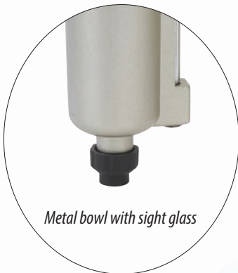
Metal bowl with sight glass