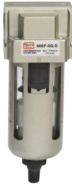
MMF-3Q-D Filter with bowl shield & automatic drain