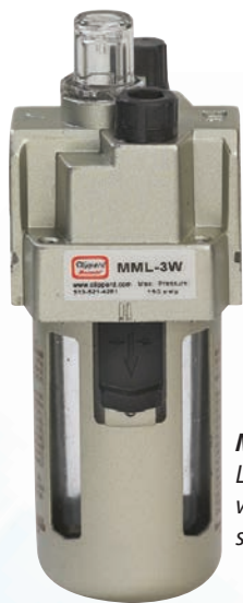
MML-3W Lubricator with bowl shield