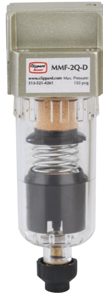
MMF-2Q-D Filter with polycarbonate bowl & automatic drain