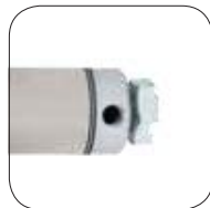
Stud, End (E)