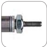
Stud, Front (S)