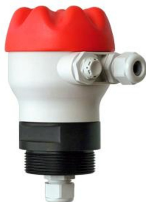
BJSC junction box (recommended option)