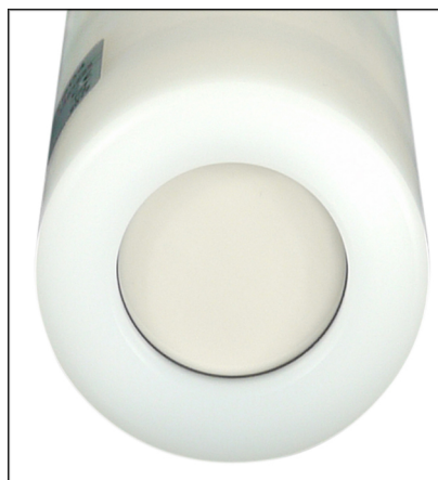
Bottom view of the ceramic cell 99,9%