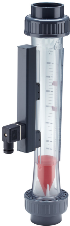
In operation with flow indicator IDP-A